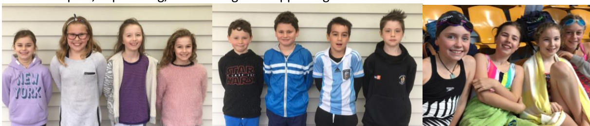
Well done to the Year 4 boys and girls relay teams came 1st.